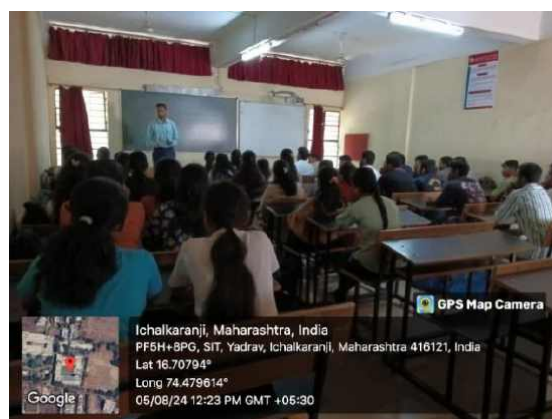
Photos of Guest Lecturer