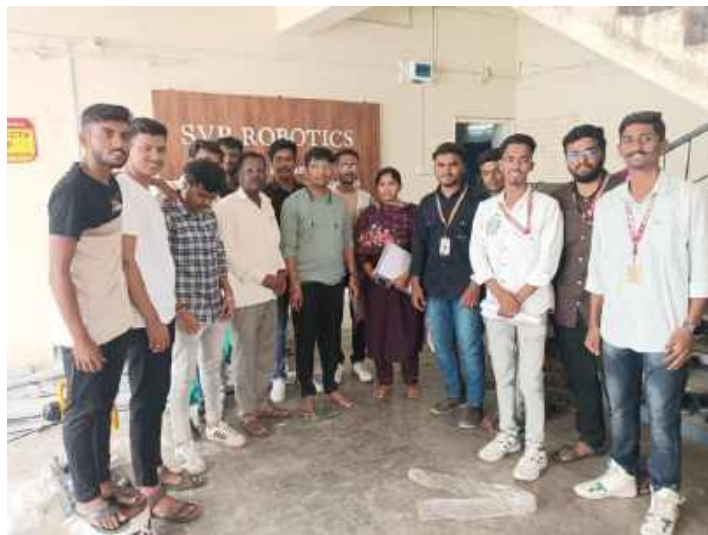
Photos of S.Y ,T.Y and B.Tech students visited companies