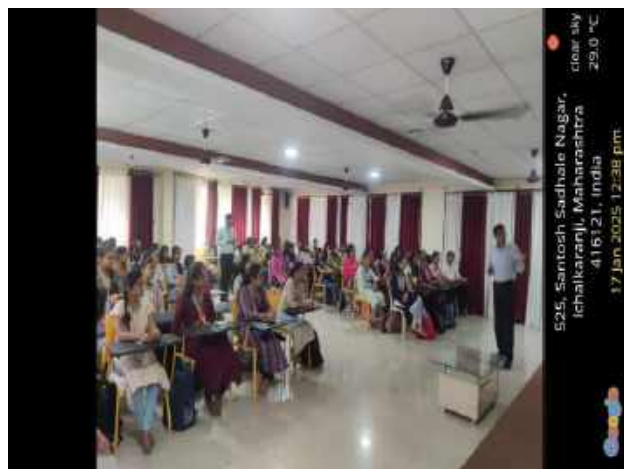
Photos of Guest Lecturer